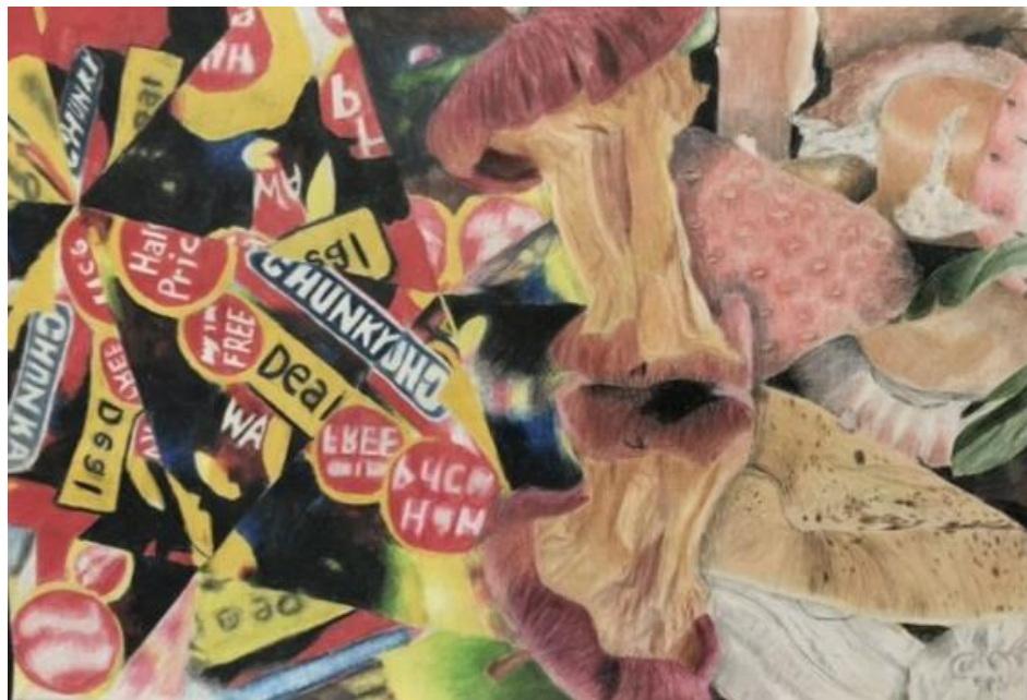
Candidate work from 2024 GCSE Graphic Communication (Competent and Consistent ability)