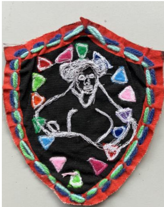
Candidate work from 2024 GCSE Photography (Confident and Consistent ability)